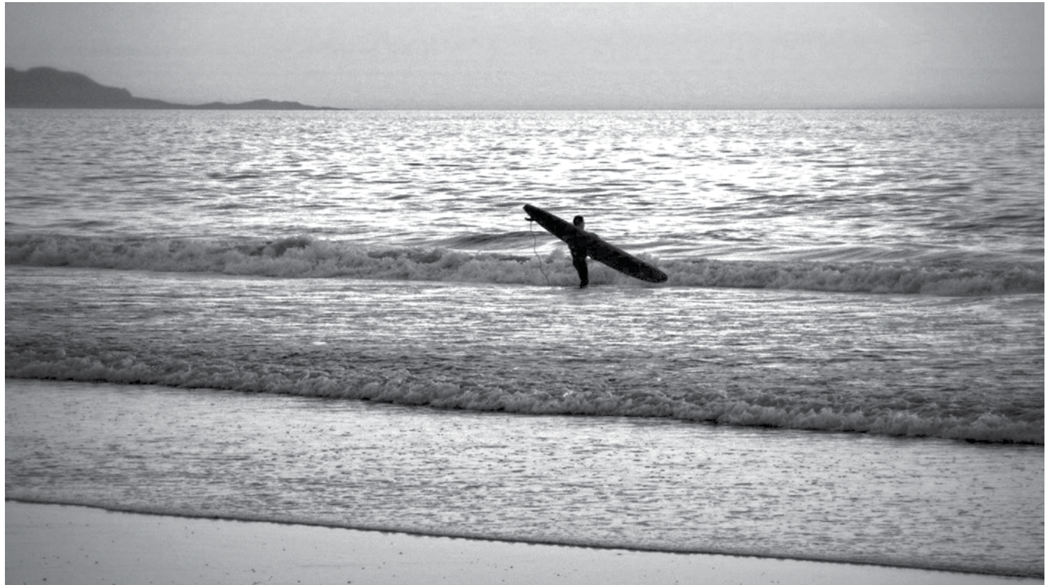
A lone longboard surfer pauses to admire another majestic sunset.